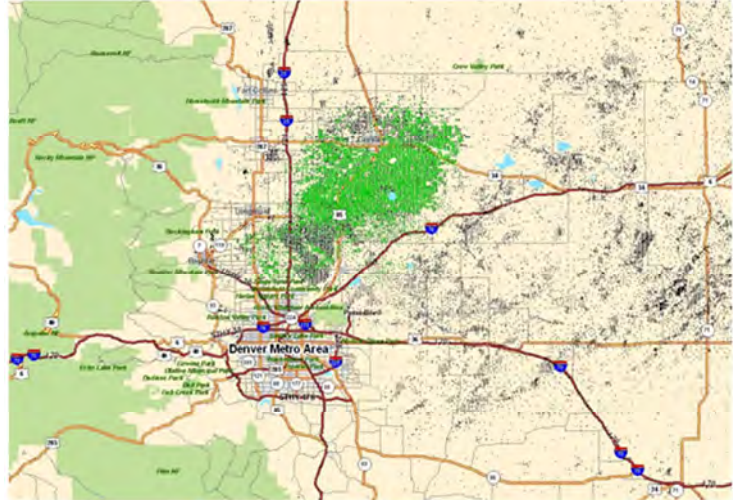
The Wattenberg Oil and Gas Field