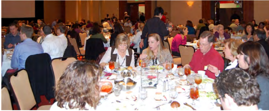
January 2012 Luncheon